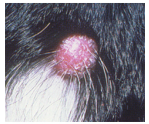
From: Dermatology by Ralf Mueller Published by Teton New Media With permission

Clinically, this tumor has a typical button-like appearance. Accurate diagnosis relies upon microscopic examination of tissue. Depending on the location, your veterinarian may recommend one or more methods of obtaining a tissue sample for diagnosis. The most common methods include needle aspiration, punch biopsy and full excision biopsy. The sample will then be examined by either cytology or histopathology. Cytology is the microscopic examination of aspirated cell samples. This is used for rapid or preliminary assessment. More accurate diagnosis, prediction of behavior (prognosis) and a microscopic assessment of whether the tumor has been fully removed rely on microscopic examination of tissue (histopathology). This is done at a specialized laboratory by a veterinary pathologist. Your veterinarian may submit a small part of the mass (biopsy) or the whole lump (an excision biopsy). If your veterinarian performed an excision biopsy, the pathologist will also assess whether the cancer has been completely removed.